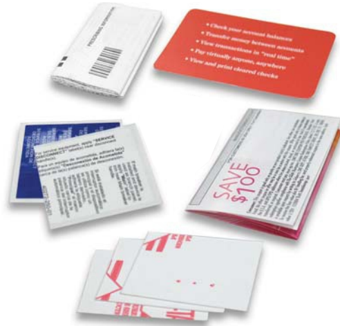
A sampling of the products that can be fed.