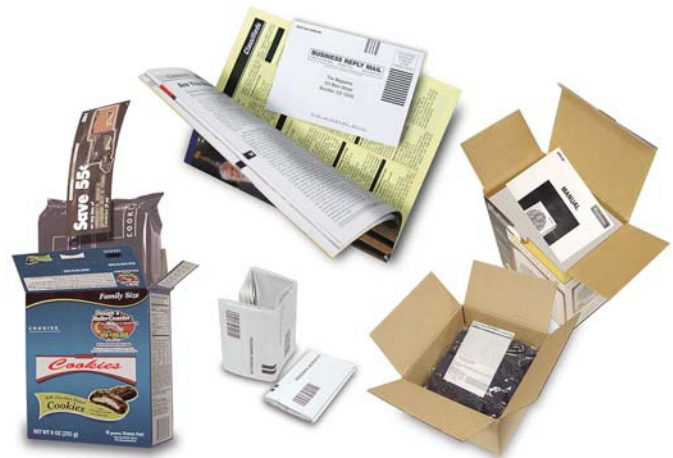
A sampling of the products that can be fed.