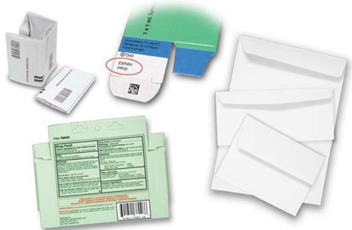
A sampling of the products that can be fed.